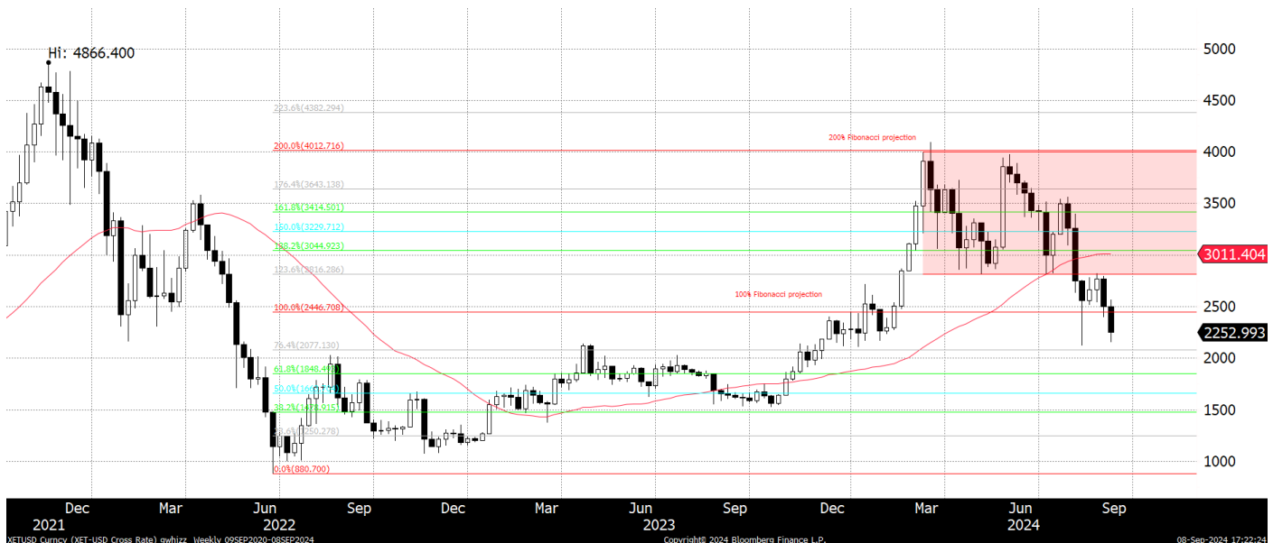
Ethereum in USD – weekly chart with 39 week moving average and Fibonacci projections

Ethereum struggled at $4,000 in March and June this year, forming a double top near 200% Fibonacci projection off the measures used for 2022. With price action below the 39-week moving average it suggests weakness, but $2,077 is the support to watch now at Fibonacci level. If it's likely to go any deeper south, this is the support signal that needs to be broken to consider risking a downdraft to $1,500. That all said, we see October as a rebound month possibly to $3,000+ resurfacing.