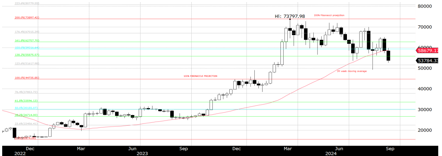
Bitcoin in USD – weekly chart with 39 week moving average and Fibonacci projections

Bitcoin is now breaking below its 39-week moving average, risking a retest of $50,000. But base support is $44,735- the 100% Fibonacci projection level that needs to hold to negate something deeper of a setback into year end. We suspect current weakness may abate by October and rebound in line with general risk, as market sentiment lifts prices into year-end back above $62,000 (near the 161.8% Fibonacci projection).