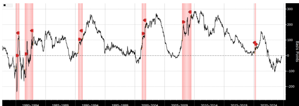
History of U.S. 2s10s inversion and past recessionary cycles (Data Bloomberg)

Nevertheless, the bigger debate for next year very much remains US debt levels - which will be a hot topic post election, with neither candidate offering clear articulation of how they will get it under control - Interest alone of $1 trillion a year and rising. This supports the thesis that yields in the belly may have fallen as far as they can go for the moment, and longer term supports crypto asset valuations as fiat devaluation continues unabated.